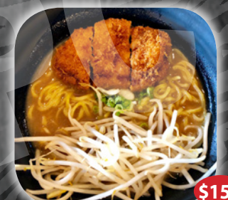
Tonkatsu Ramen (Pork Cutlets) $15.95

Authentic Pork Bone Broth topped with Chicken Karaage, Bean Sprout, green onion.