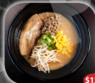
Miso Ramen $12.50

Authentic Pork Bone Broth topped with Chashu Pork, bean sprouts, green onions, egg.