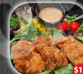
Chicken Karaage Salad $12.95