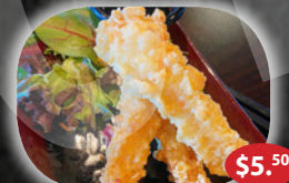
Shrimp Tempura 3pcs $5.50