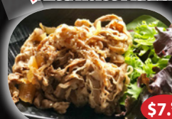
Sukiyaki Beef $7.95