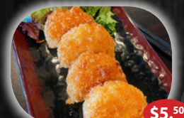
Korokke 2pcs (Potato Veggies Croquette) $5.50