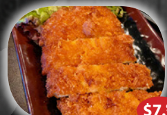
Tonkatsu (Pork Cutlet) $7.95