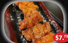
Chicken Karaage 5pcs $7.75