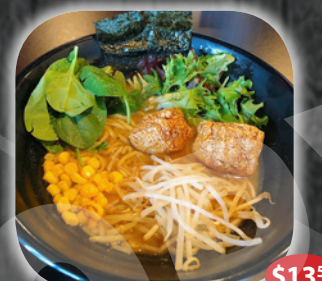
Vegetarian Ramen $13.50

Homemade Creamy Sesame Paste Broth with Homemade Spice topped with spicy ground pork, baby spinach, bean sprouts, sesame.