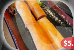
Vege Spring Roll 4pcs $5.75