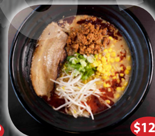
Spicy Miso Ramen $12.50

Blended Flavor with Japanese Miso Paste Broth topped with Chashu Pork, ground pork, bean sprouts, green onions, corn.