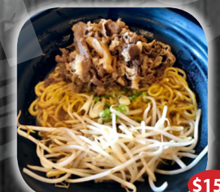
Sukiyaki Beef Ramen $15.95

Authentic Pork Bone Broth topped with Pork Cutlet, Bean Sprout, green onion..