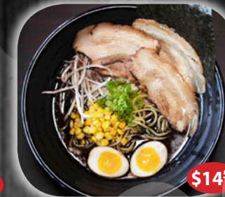
Deluxe Ramen $14.50

Authentic Pork Bone Broth Tonkotsu with Mayo, Egg, Fresh Garlic.