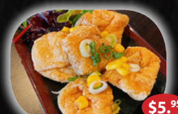
Fried Tofu 5pcs $5.95