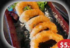
Calamari 5pcs $5.45