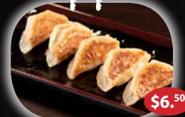
Pork Gyoza 5pcs $6.50