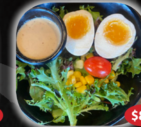
Egg Salad $8.95