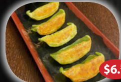
Veggie Gyoza 5pcs $6.50