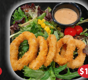
Calamari Salad $11.95