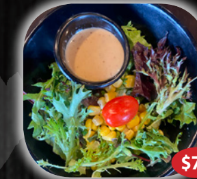
House Green Salad $7.95