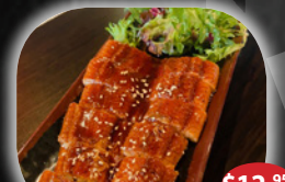
Unagi Kabayaki (BBQ Eel) $12.95