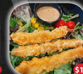
Shrimp Tempura Salad $12.95