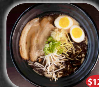
Tamago Garlic Ramen $12.95

Blended Flavor with Japanese Miso Paste Broth with homemade spicy topped with Chashu Pork, spicy ground pork, bean sprouts, green onions, corn.