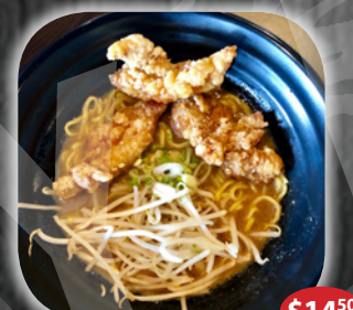
Chicken Ramen $14.50

Sesame Paste Broth with Fried Tofu, Veggies, Corn, Bean Sprout, Spinach and Dry Seaweed.