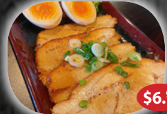
Chashu Egg 3 pcs Seared Chashu+1 pcs Soft Boil Egg $6.95