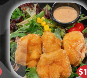
Fried Tofu Salad $11.95