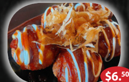
Takoyaki 5pcs $6.50