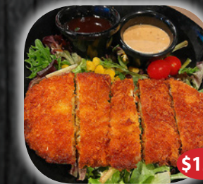
Tonkatsu Salad (Pork Cutlet) $12.95