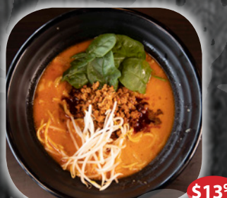
TanTan Men $13.95

Authentic Pork Bone Broth Tonkotsu topped with additional Chashu, Egg, Bean sprouts, green onions, corn, mayu, Dry Seaweed.