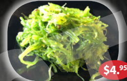
Seaweed Salad $4.95