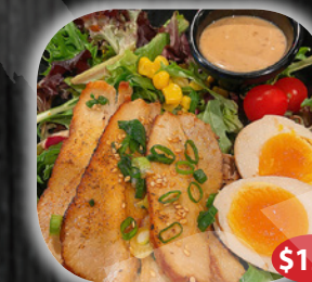
Chashu Egg Salad $12.95