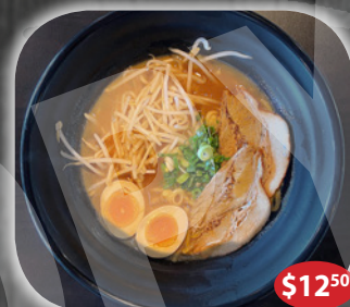
Tonkotsu Ramen $12.50

Authentic Pork Bone Broth topped with Chashu Pork, bean sprouts, green onions, egg.