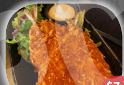
Aji Fry 2pcs (Fried Horse Mackerel) $7.75